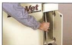
Cassette Storage Bin/Accessory Drawer. Cassettes and positioning tools within finger-tip reach.