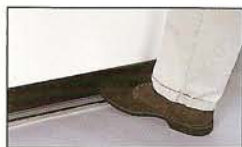
Foot Treadle. No-hands control of prep mode and moment of exposure.