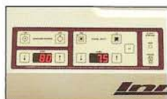
Front Mounted, Tilt-Out Control Panel (standard). Quick, easy access for persons of any height.