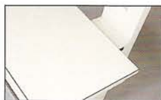
Float Top. Effortless patient positioning.