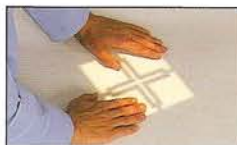
No-hands Collimator. Activate the light while holding the patient.